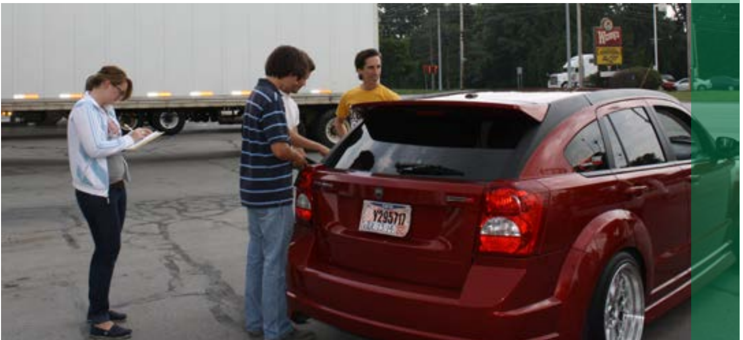
Gas Cap testing | Photo by TMACOG staff

Transportation Improvement Program (TIP) Committee Time: 1:30 p.m. Location: TMACOG Boardroom Contact: Lance Dasher, ext. 115