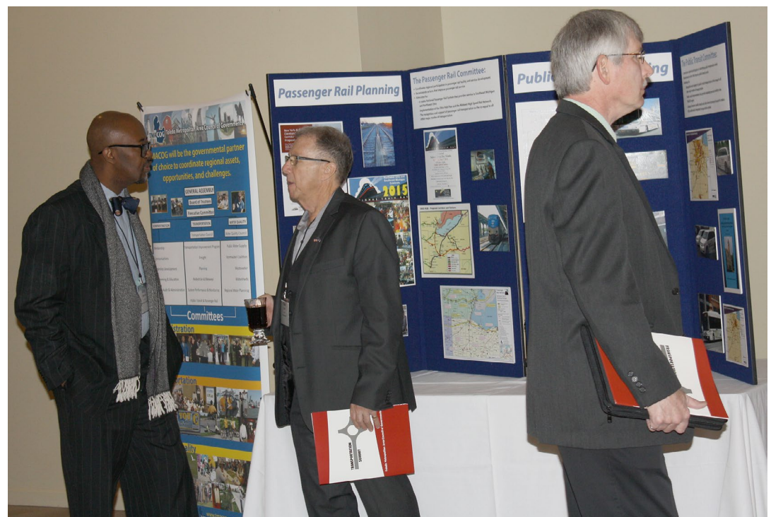
TMACOG Transportation Summit 2016