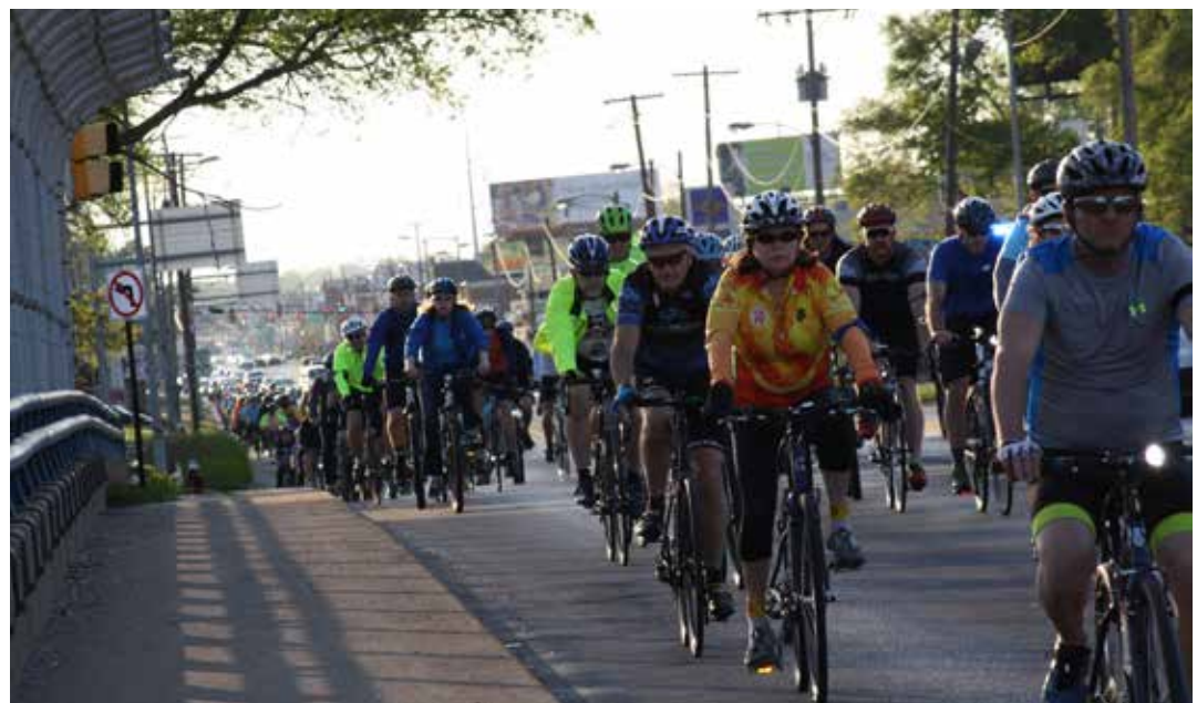
Ride of Silence 2016