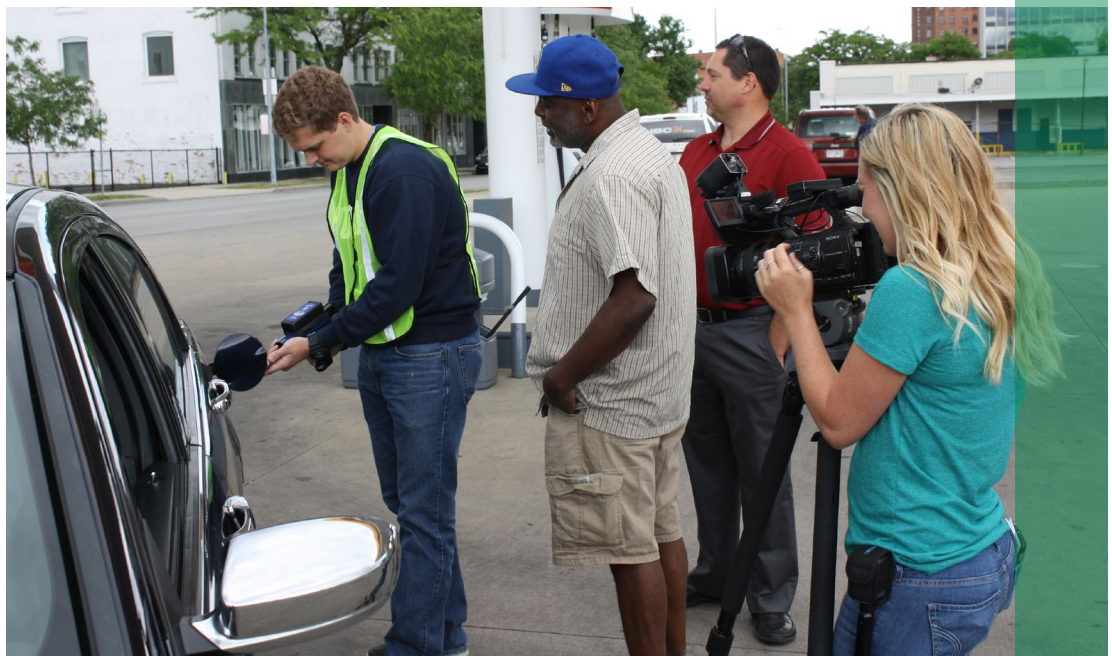
Gas Cap Testing program

Time: 2 p.m. Location: TMACOG Boardroom Contact: Kari Gerwin, ext. 103