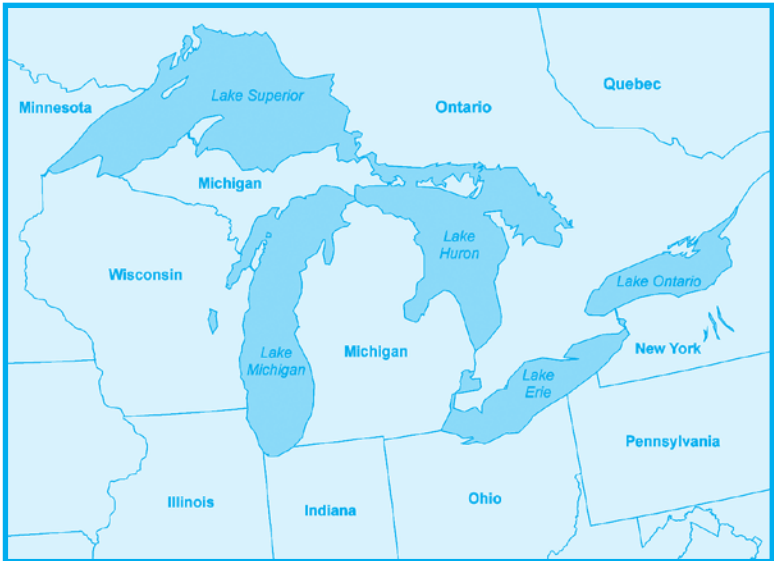
The eight Great Lakes states in the Great Lakes Basin Water Resources Compact are Illinois, Indiana, Michigan, Minnesota, New York, Ohio, Pennsylvania, and Wisconsin. The two Canadian provinces are Ontario and Quebec.