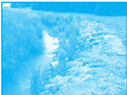
Portage River tributary showing outfall.

Homeowners can also download the application from the TMA-COG website: www.tmacog.org . This project is for residential systems only, not for businesses or institutions. It will not pay for sewer taps, or for systems that discharge off-lot.