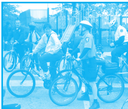
TMACOG's Bike to Work Day 2008. Riders gather at Walbridge Park (top) to ride downtown with an escort from the Toledo Police Mountain Bike Unit.

TMACOG has many resources for both the recreational and commuting bike rider. TMACOG's Bicycle Facilities Guide for Recreational Riding is a 16-page manual that includes maps of existing bike paths, signed bike routes and bike lanes. The guide is available at bike shops and at TMACOG. Commuters can refer to the Bike and Pedestrian pages at www.tmacog.org to find information on signed bike routes and bike lanes that connect to major destinations. See page 3 for more information on bike trails.