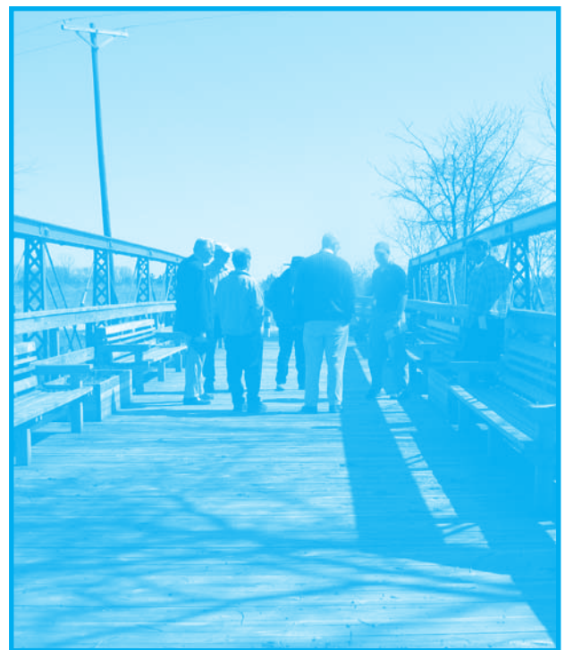
The April meeting of the Portage River Basin Council was at the Wood County Historical Center and Museum just south of Bowling Green. After the meeting, council members inspected the new walking bridge across the North Branch Portage River on the property of the historical center.

The Swan Creek BGP has been approved by TMACOG's Environmental Council, and will next be considered by the Executive Committee and Board of Trustees at their June meetings. To see the complete final report including an extensive series of maps that define the plan, see www.tmacog.org/Environment/swanpilot.htm .