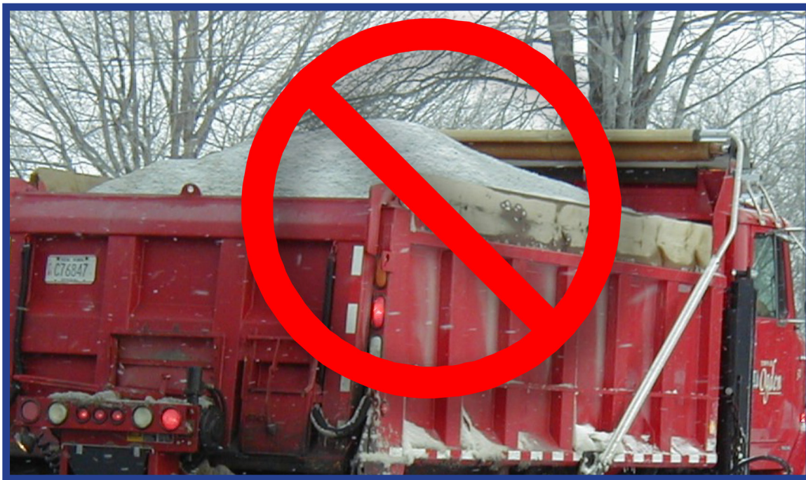
Salt truck.