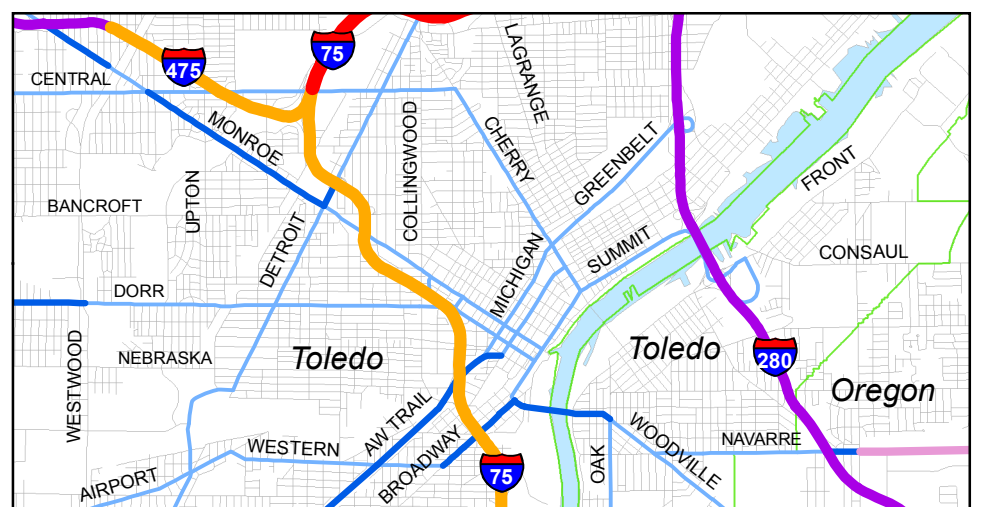
Central Toledo Area