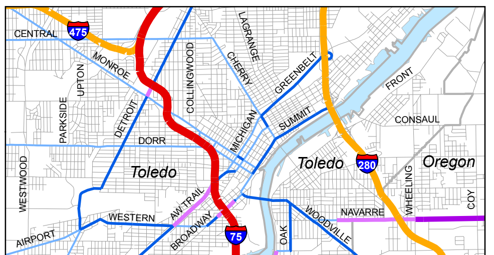
Downtown Toledo Inset