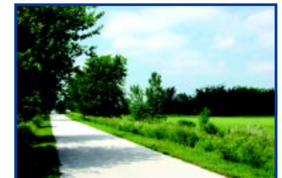
Slippery Elm Trail

For more information on new and upcoming projects, or to find out how you can be involved in planning the region’s future, contact TMACOG and the TMACOG Pedestrian & Bikeways Committee at 419/241-9155, Ext. 117, or e-mail public.info@tmacog.org . You can also visit the TMACOG web site at www.tmacog.org .