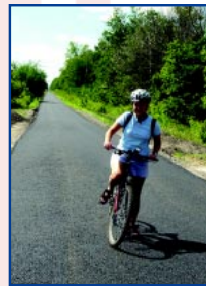
Wabash Cannonball Trail

City of Perrysburg is working on a second phase of the Connector. (See 7. above.)